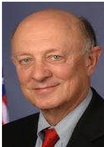
CIA/DynCorp Director R. James Woolsey SON??