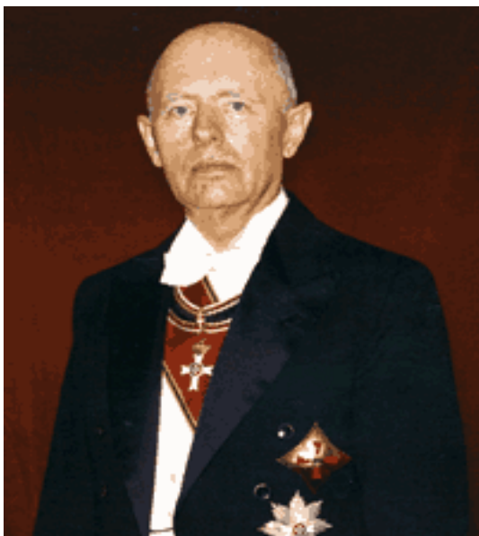
Nazi SS Gestapo Chief Reinhardt Gehlen FATHER??